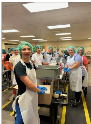
Pictured here is our team with youth from Ames, IA who stayed in our church building