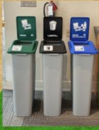
The Gathering Place