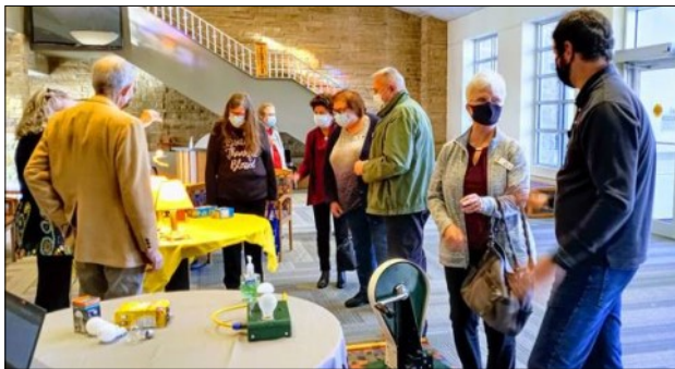
This Sunday interactive activity was one of many to help educate the congregation about the energy efficiency of LED lighting.

focus, we will be reducing our negative impact on global warming.