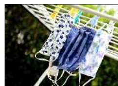
Video for mask-making: fabric mask-making tutorial

Donate masks for distribution by Iglesia Comunitaria de Omaha , please drop them off at FUMC Omaha, 7220 Cass St. between 9am and 1pm, Monday - Thursday. A container will be provided outside the door for curbside drop-off and masks will be delivered to the church.