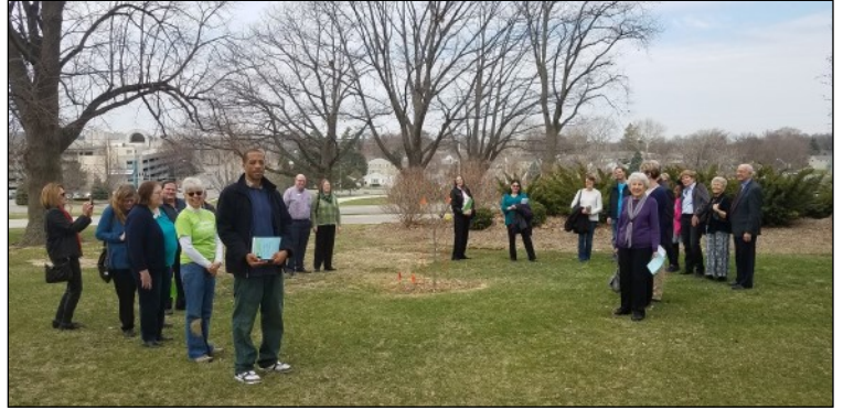
Tree Dedication, April 22, 2018